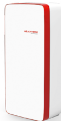
Heat pump

On the basis of these simulations various approaches to using heat pumps as storage and its direct linking to the PV equipment are to be improved, so as to level loads and minimize cost for the reference buildings. A direct link between PV and heat pump, and the control strategies developed, will be tested on a prototype. ■