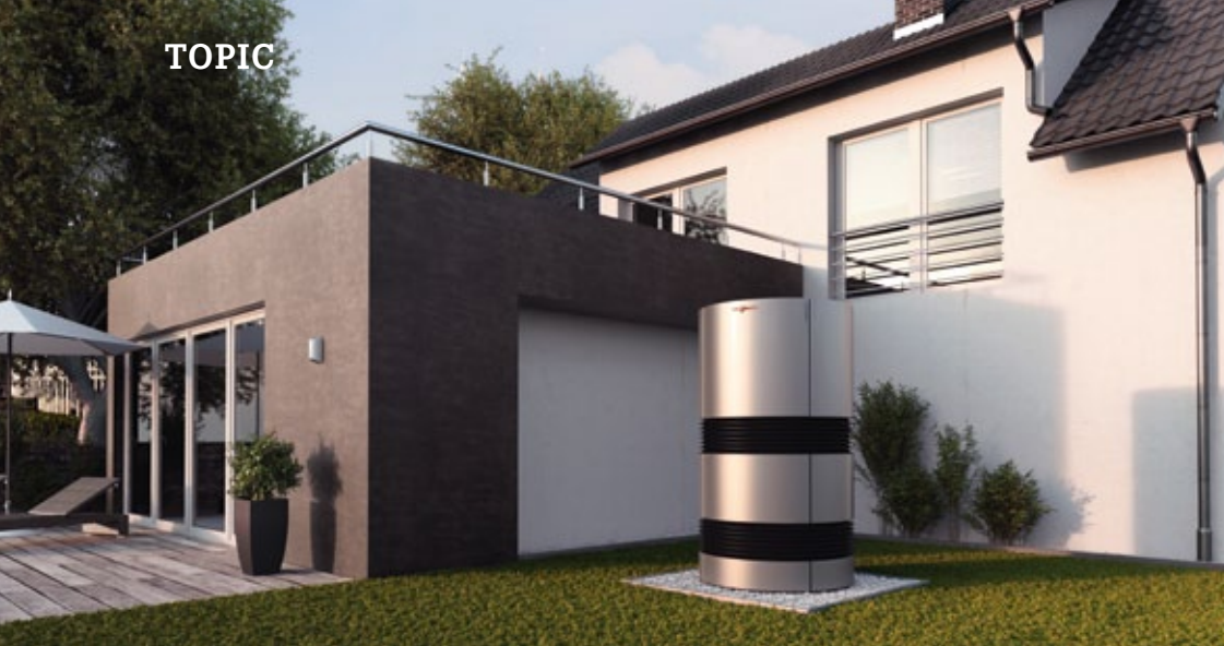
Air/water heat pump