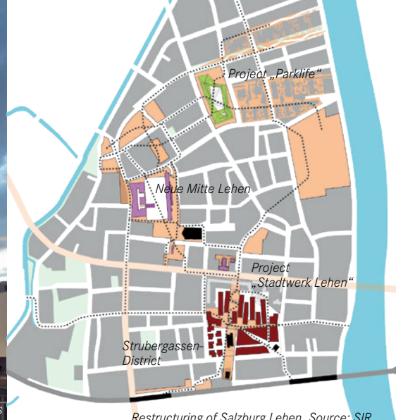
Restructuring of Salzburg Lehen