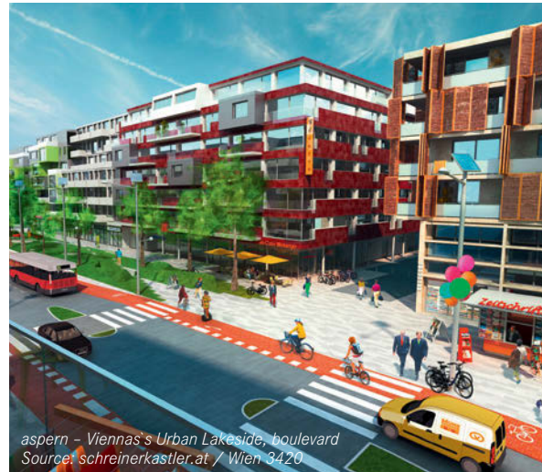
aspern - Viennas's Urban Lakeside, boulevard