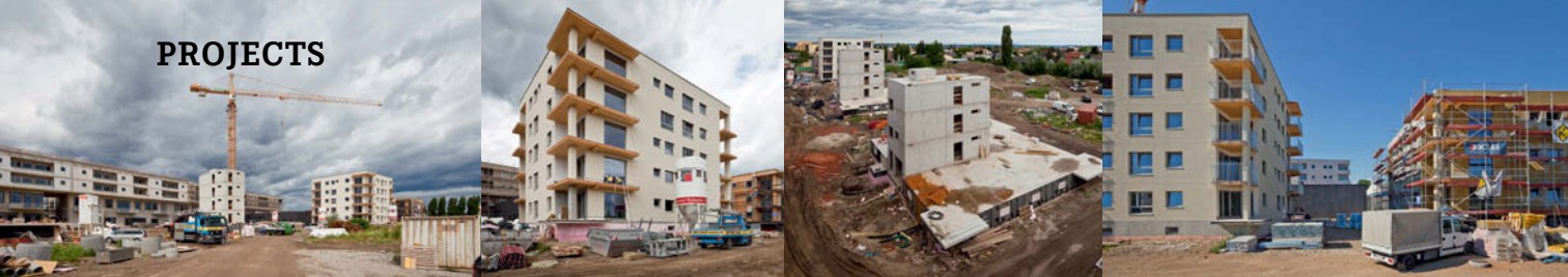
Phases of construction at surplus-energy cluster Reininghaus Süd