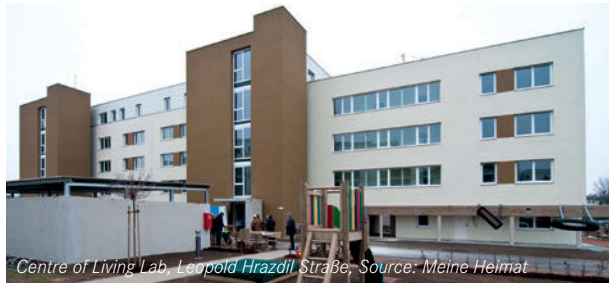
Centre of Living Lab, Leopold Hrazdil Straße

Working together with well-known partners from industry and research (AIT Energy Department, CTR Carinthian Tech Research, FH Kärnten and the four companies KNG Kärnten Netz GmbH, Infineon, Alpine Energie, Siemens, RMA Ressourcen Management Agentur, Symvaro GmbH and PwC Advisory Services GmbH), the City of Villach is taking the first steps toward implementing Smart City Villach in the project Vision Step I.