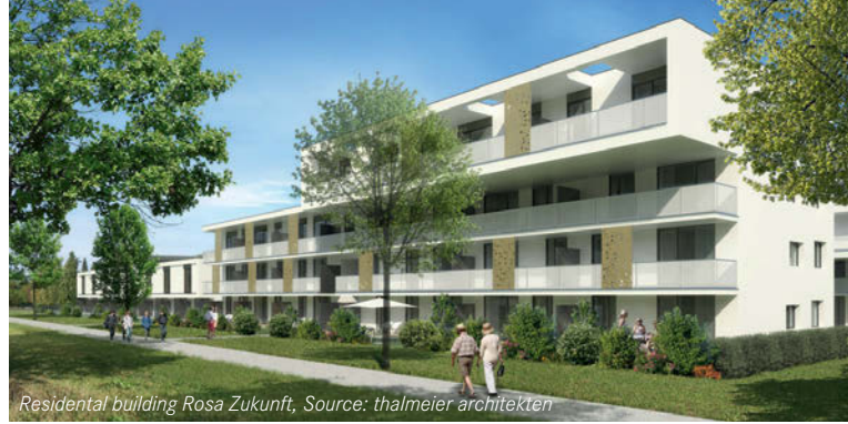
Residential building Rosa Zukunft

In the pioneer project HiT (buildings as interactive participants in a Smart Grid) all relevant Smart Grid low-voltage elements are linked up in an integrated building strategy. The project encompasses planning, constructing, running and monitoring an apartment complex with 130 flats (rented out and owner-occupied) for various groups of occupants. Here key issues to do with generating energy from renewable sources, building technologies and storage facilities, and