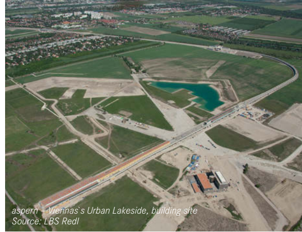
aspern - Viennas's Urban Lakeside, building site

In this programme Austrian towns and cities are developing strategies and arrangements for the Smart City and have already started to implement these successfully in specific pilot projects. From the initiatives mentioned, here are some examples to show the wide range of Austrian activities. ■