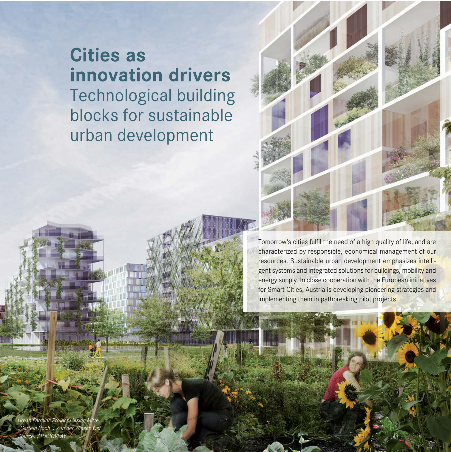
Urban Farming Project Liesing Mitte „Garteln Hoch 3 / In der Wiesen-Ost“

Tomorrow's cities fulfil the need of a high quality of life, and are characterized by responsible, economical management of our resources. Sustainable urban development emphasizes intelligent systems and integrated solutions for buildings, mobility and energy supply. In close cooperation with the European initiatives for Smart Cities, Austria is developing pioneering strategies and implementing them in pathbreaking pilot projects.