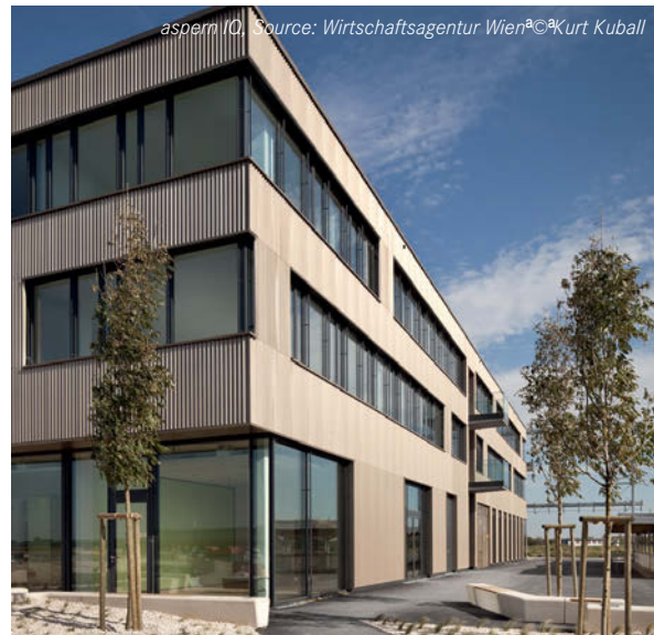
aspern IQ