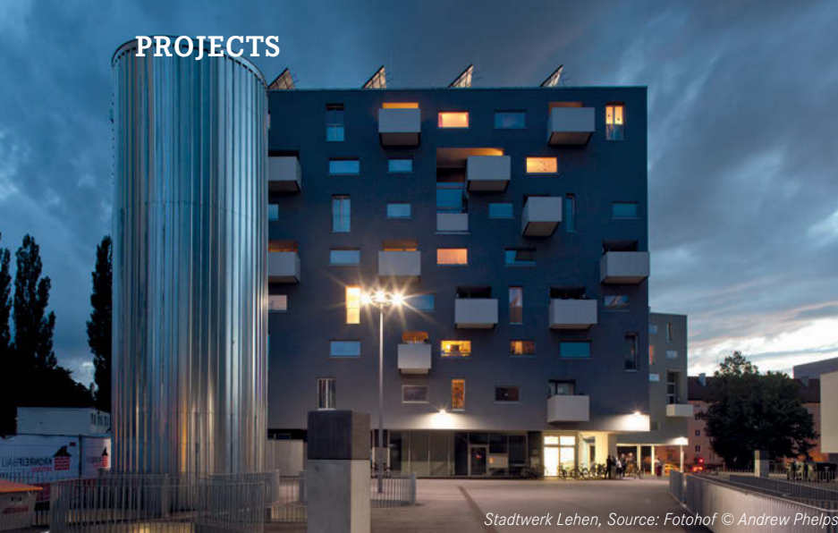
Stadtwerk Lehen