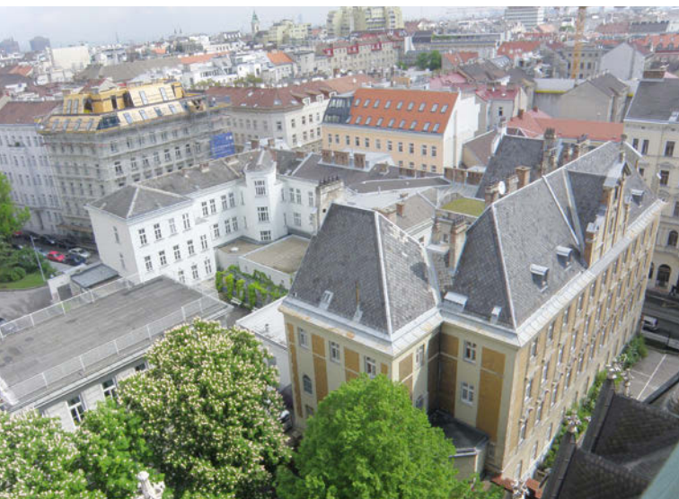
Kaiserstraße Vienna