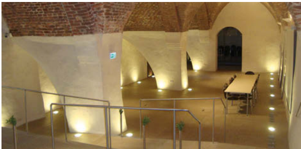
Renovated function room, Source: AEE INTEC

The starting-point for renovation was a master plan (Arch. DI Michael Lingenhöle) with a comprehensive strategy for modernizing the entire monastery premises. Together with experts from AEE INTEC, the (utterly committed) monks succeeded in developing a four-stage “energy vision” for the monastery and implementing it, starting in 2010 (Architecture HoG Architekten).